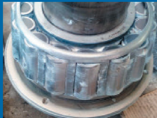
Bearings using ROCOL® foodlube premier 1 (after 5 months)